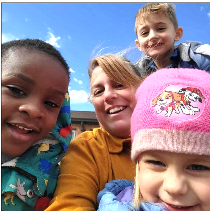
Enjoying some outside time!